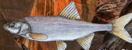
Virgin River Chub

A key function of the Virgin River Program is to reconcile and avoid potential conflicts between water development and wildlife conservation. The Program simplifies regulatory processes for water users and landowners while ensuring that future generations can enjoy Utah's natural heritage.