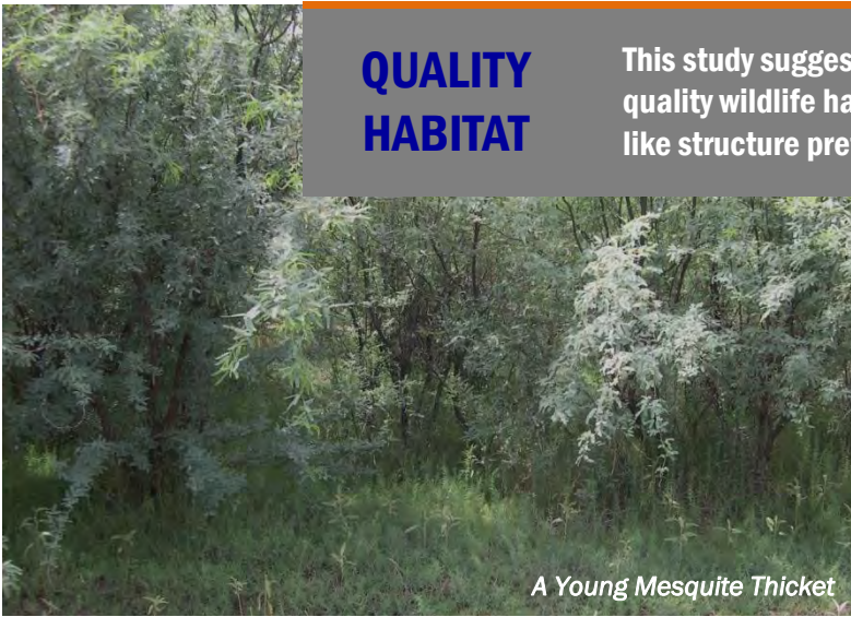
A Young Mesquite Thicket

This study suggests that thinning can accelerate development of higher-quality wildlife habitat in young mesquite stands by establishing a bosque-like structure preferred by a diversity of birds and wildlife species.