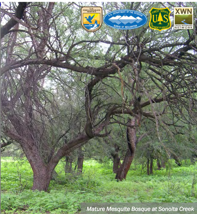
Mature Mesquite Bosque at Sonoita Creek