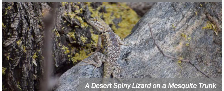
A Desert Spiny Lizard on a Mesquite Trunk

For additional project resources and case studies, visit the Collaborative Conservation and Adaptation Strategy Toolbox: WWW.DESERTLCC.ORG/RESOURCE/CCAST