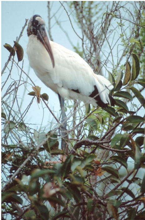
Figure 3. Species such as the wood stork that rely on freshwater wetlands may be more sensitive to changes in precipitation than to changes in temperature.