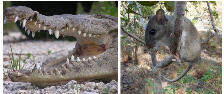
Figure 4. The American crocodile and the Key Largo woodrat are expected to have different responses to changing temperature because of their different life history characteristics.

We will produce a synthesis of existing information in databases, models, maps (including digital range maps), documentation, and fact sheets. This information provides the foundation for updating recovery plans, assessing vulnerability of species to climate change, and examining alternative futures. This project also provides methods that can be applied to other species and areas.