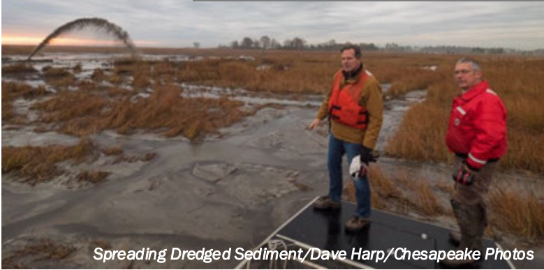
Spreading Dredged Sediment

On September 16, 2022 Maryland was declared free from nutria. The last known nutria capture was in May 2015. Collaboration among federal and state agencies and over 700 landowners made the eradication of nutria possible.