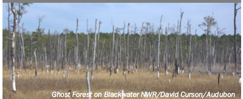
Ghost Forest on Blackwater NWR