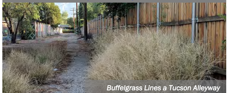
Buffelgrass Lines a Tucson Alleyway