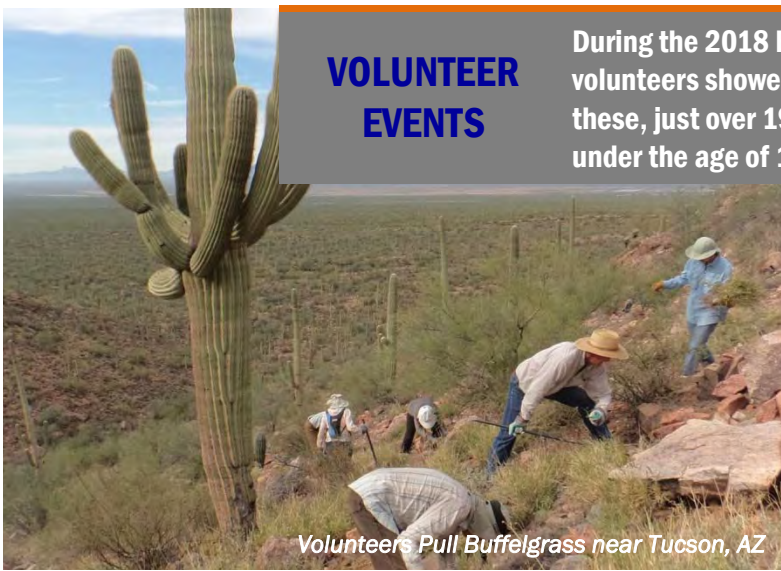
Volunteers Pull Buffelgrass near Tucson, AZ

During the 2018 Beat Back Buffelgrass month, approximately 450 volunteers showed up across 30 different sites throughout the month. Of these, just over 190 had never pulled buffelgrass before and 127 were under the age of 18.